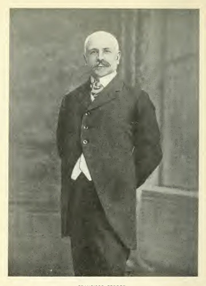
FRANCISCO FERRER. FROM A PHOTOGRAPH REPRODUCED FROM "THE LITERARY GUIDE."